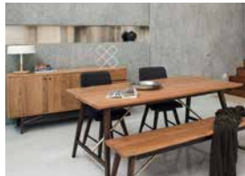
Dining Room Furniture