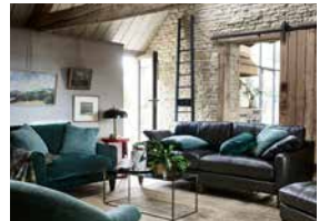
Living Room Furniture