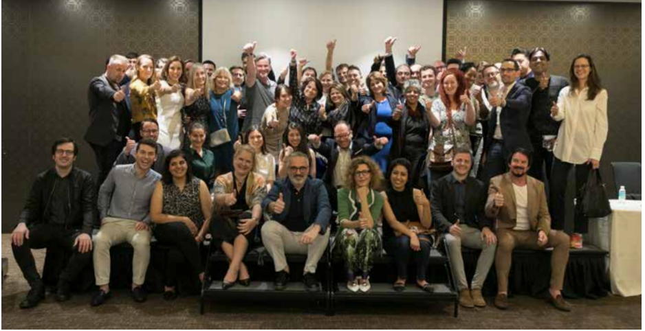
Networking for New Buyers @ IFFS 2018

"Global markets are picking up and we're here as a 17-company pavilion to bring Indonesia products to worldwide audiences. The IFFS platform helps our companies to gain good international visibility, so we hope to continue this collaboration at the new venue next year and beyond."