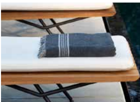
Garden/ Outdoor Furniture